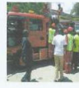
ISIOLO COUNTY FIRE FIGHTERS