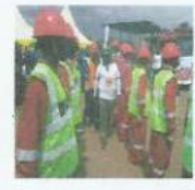
GUARD OF HONOUR. BY GOVERNOR

HON. MOSES K. MWONGERA - Moses Kithinji ISIOLO COUNTY ASSEMBLY - LEADER OF MINORITY