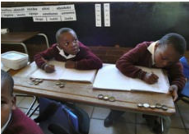
Coke bottle tops - math toys

With the idea that Japanese mathematic toys kit might be able to contribute to the solving of the problem, Sapesi-Japan recently sent us approximately 100 sets of Japanese mathematic toy kits. We would like to pursue the possibility to develop its South African version with the people who are interested in the project.