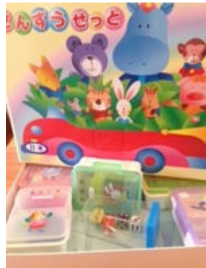
Mathematics toy kit