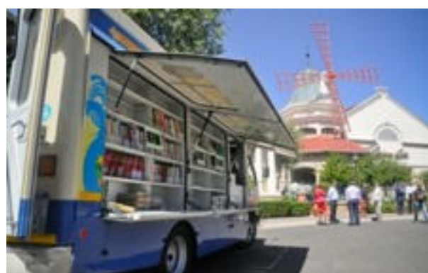
Bloemfontein - 31 October 2013

We thank you, our supporters, especially the Japanese Ministry of Foreign Affairs, and MOL shipping company for the buses' donation. Also Sony companies in South Africa, Australia, New Zealand, Singapore, Malaysia, USA, Canada, UK, Hong Kong, and Japan, together with K-line shipping company for the global children's book donation.