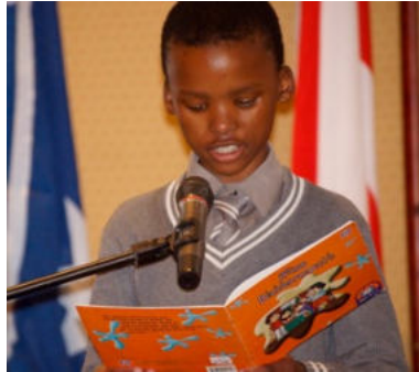
Learners from Motheo District reading from books